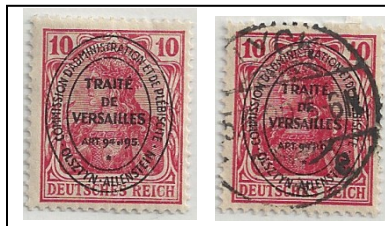
16 mint / CTO