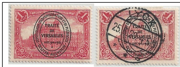
24 mint / CTO