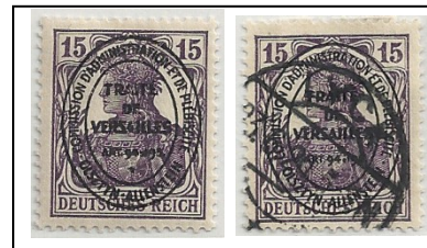
17 mint / CTO