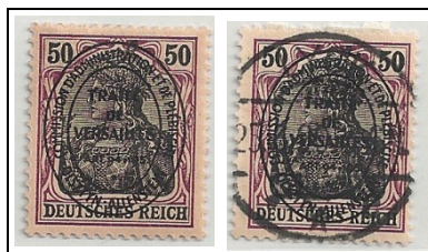
22 mint / CTO