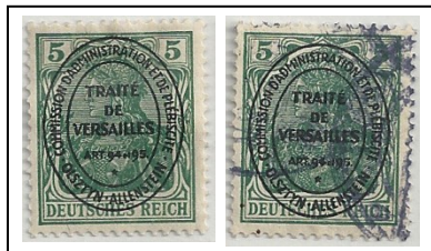
15 mint / used

To advertise the plebiscite, special postage stamps were produced by overprinting German stamps and sold from 3 April. The overprint reads "TRAITÉ / DE / VERSAILLES / ART. 94 et 95" referring to the Articles 94 and 95 of the treaty of Versailles inside an oval whose border gave the full name of the plebiscite commission.