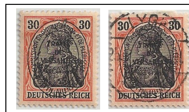
20 mint / CTO