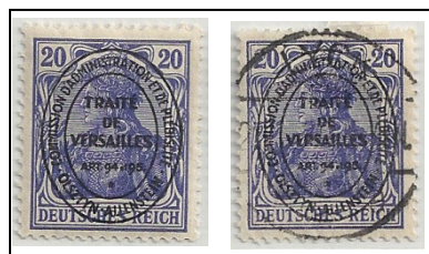
19 mint / CTO