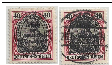
21 mint / CTO