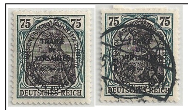
23 mint / CTO