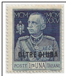
22a perf 13½