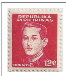
N33 Rev. Jose Burgos