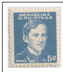
N32 Jose Rizal