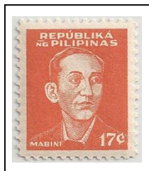
N34 Apolinario Mabini