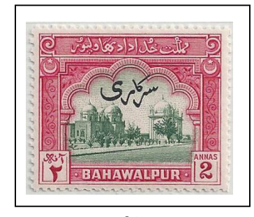
O19 Tombs of the Amirs

O18 Nawab Sadiq Muhammad Khan V Abbasi Bahadur