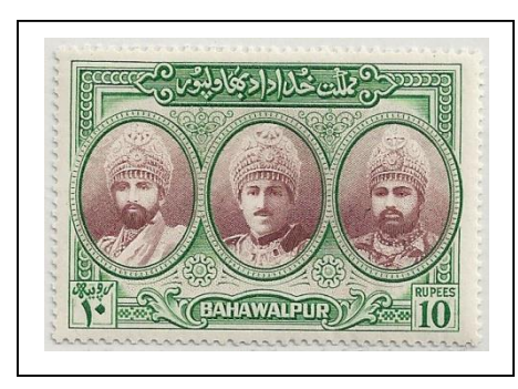
21 Three generations of the rulers.