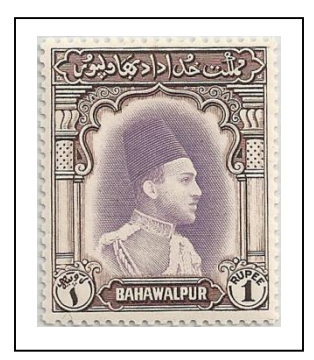
12 Nawab Sadiq Muhammad Khan V Abbasi Bahadur

watermarked #274, multiple perforations, engraved