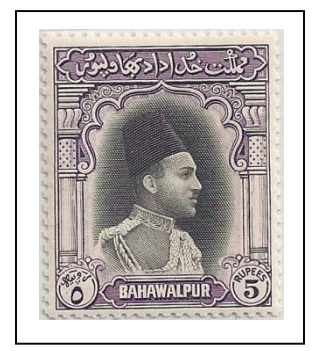
14 Nawab Sadiq Muhammad Khan V Abbasi Bahadur