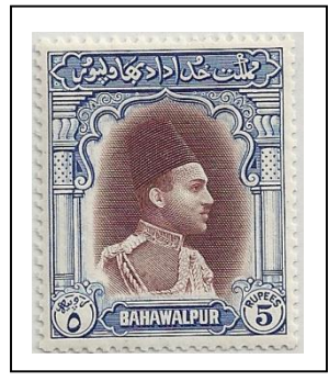
20 Nawab Sadiq Muhammad Khan V Abbasi Bahadur