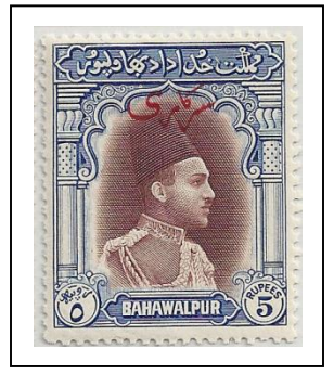
O23 Nawab Sadiq Muhammad Khan V Abbasi Bahadur