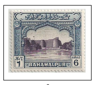
9 Fort Dirawar