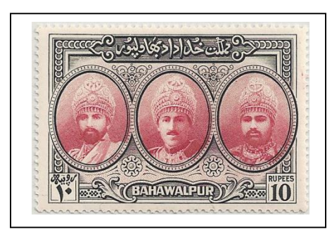
15 Three generations of the rulers.