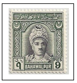
Nawab Sadiq Muhammad Khan V Abbasi Bahadur