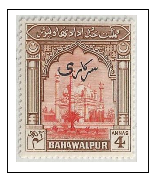
O20 Mosque at Sadiq Garh