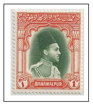
18 Nawab Sadiq Muhammad Khan V Abbasi Bahadur

watermarked #274, multiple perforations, engraved