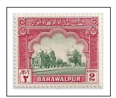
7 Tombs of the Amirs