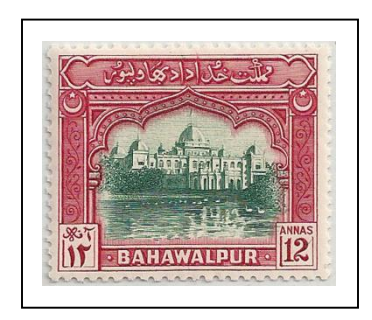
11 Palace Sadiq Garh