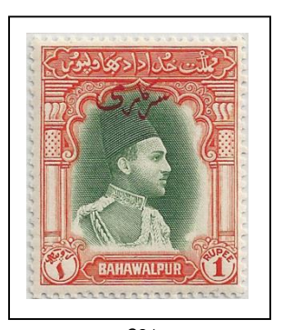
O21 Nawab Sadiq Muhammad Khan V Abbasi Bahadur