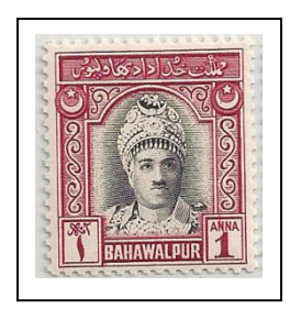
5 Nawab Sadiq Muhammad Khan V Abbasi Bahadur