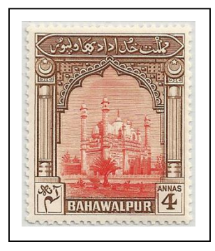
8 Mosque at Sadiq Garh