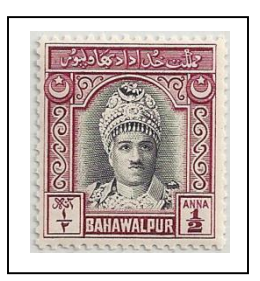
Nawab Sadiq Muhammad Khan V Abbasi Bahadur