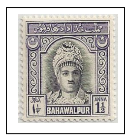
6 Nawab Sadiq Muhammad Khan V Abbasi Bahadur