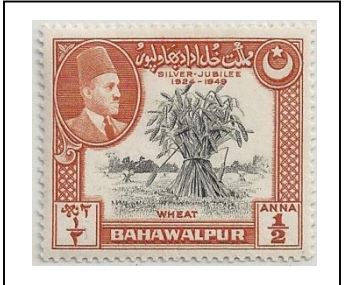
23 Wheat sheaf