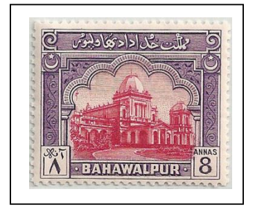
10 Nur-Mahal Palace