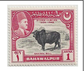
25 Sahiwal Bull