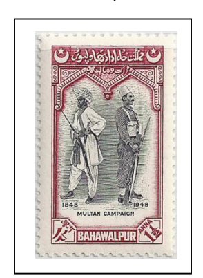
16 Soldiers of 1848 and 1948