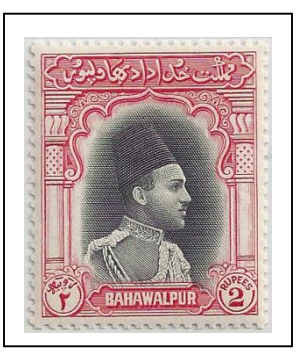
19 Nawab Sadiq Muhammad Khan V Abbasi Bahadur