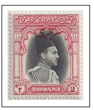
O22 Nawab Sadiq Muhammad Khan V Abbasi Bahadur