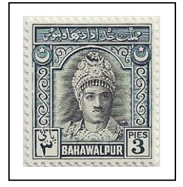
Nawab Sadiq Muhammad Khan V Abbasi Bahadur

watermarked #274, multiple perforations, engraved