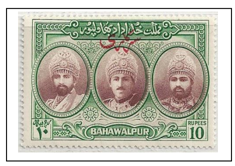
O24 Three generations of the rulers.