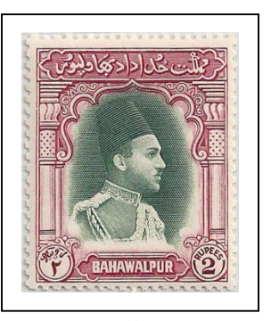
13 Nawab Sadiq Muhammad Khan V Abbasi Bahadur