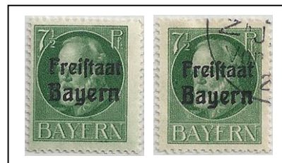
195 mint / postmarked