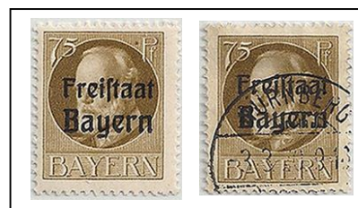
204 Mint / postmarked