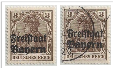
177 mint / postmarked