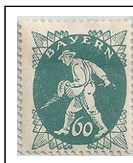
245 mint / postmarked Sewer