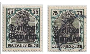
186 mint / postmarked