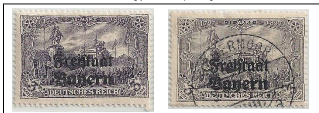
190 mint / postmarked