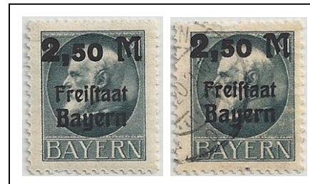
233 mint / postmarked