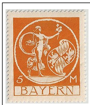
252 von Kaulbach's "Genius"