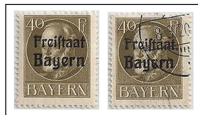
201 mint / postmarked