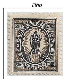
255 Madonna and Jesus

watermark 95 horizontal, perf 11½ x12, photogravure