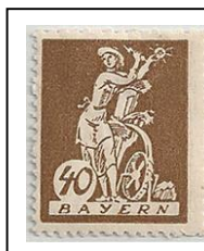
243 mint / postmarked "Electricity", waterwheel harnessing light