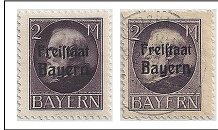
207 mint / postmarked