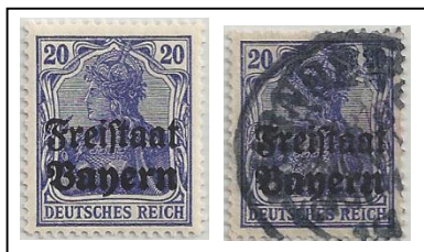
182 mint / postmarked