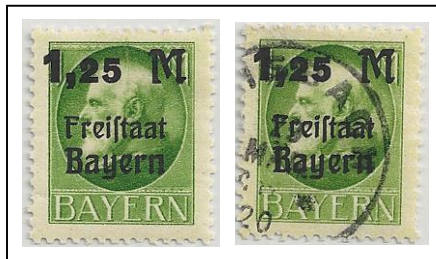
231 mint / postmarked

King Ludwig III Design overprinted "Freistaat Bayern" and surcharged watermark 95 horizontal, perf 11½ , photogravure