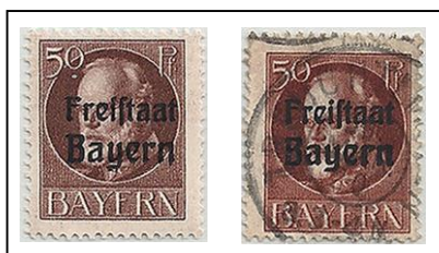
202 Mint / postmarked