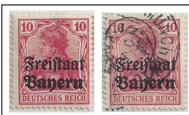
180 mint / postmarked