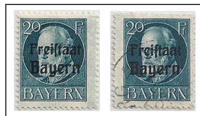
198 mint / postmarked