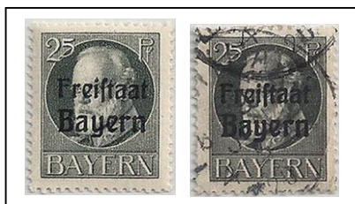
199 mint / postmarked