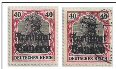
185 mint / postmarked