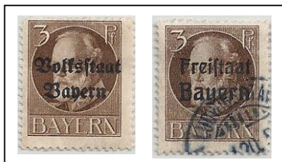
193 mint / postmarked

watermark 95 horizontal, perf 14x14½, photogravure