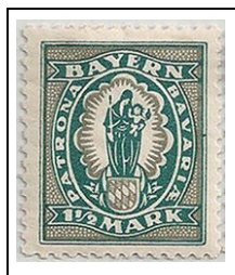
249 Madonna and Jesus