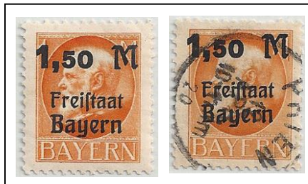
232 mint / postmarked