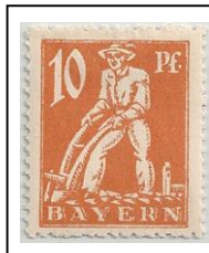
239 mint / postmarked Plowman