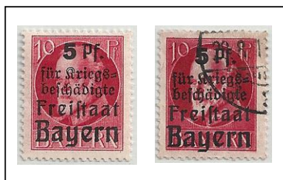
B1 mint / postmarked