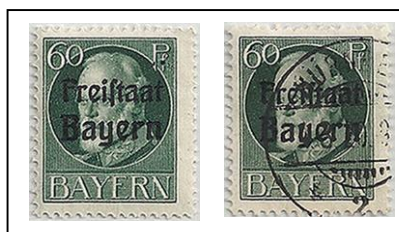
203 Mint / postmarked