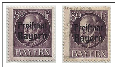
205 mint / postmarked