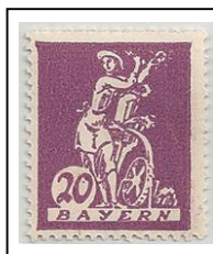
241 mint / postmarked "Electricity", waterwheel harnessing light