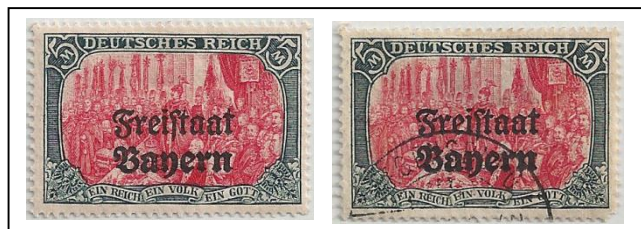
191 mint / postmarked