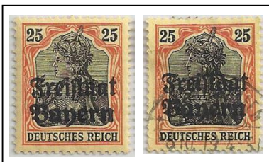
183 mint / postmarked