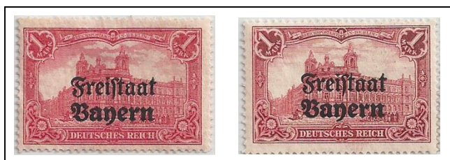
188 seemingly different printings