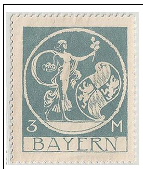
251 von Kaulbach's "Genius"

watermark 95 horizontal, perf 11½ x12, photogravure