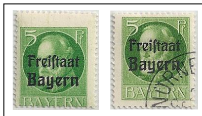
194 mint / postmarked