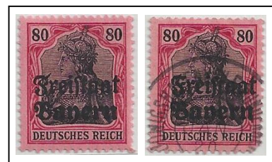
187 mint / postmarked