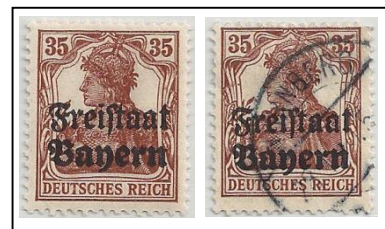
184 mint / postmarked