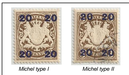
Michel type I

Michel records two different types Type I – numbers are 5.8-6.3 mm apart Type II – numbers are 3.5-5mm apart