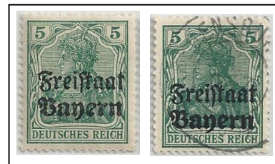
178 mint / postmarked