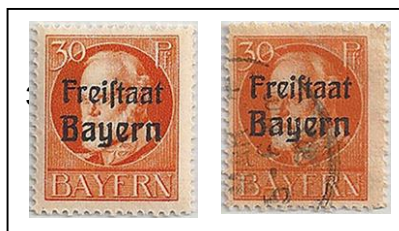
200 mint / postmarked