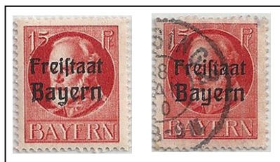
197 mint / postmarked