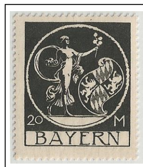
254 von Kaulbach's "Genius" 20 May, 2015