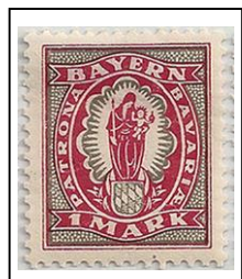
247 Madonna and Jesus

watermark 95 vertical, perf 12 x 11½, photogravure