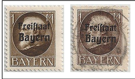
206 mint / postmarked

watermark 95 vertical, perf 11½, photogravure