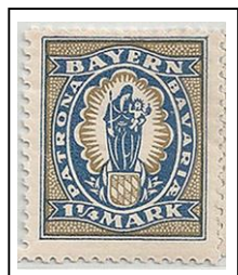
248 Madonna and Jesus