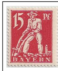
240 mint / postmarked Plowman