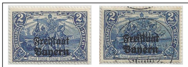
189 mint / postmarked