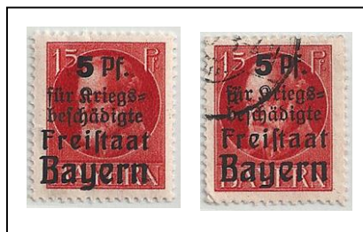
B2 mint / postmarked