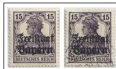
181 mint / postmarked