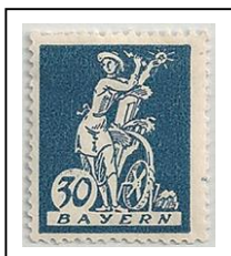
242 "Electricity", waterwheel harnessing light