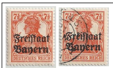
179 mint / postmarked