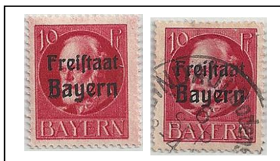
196 mint / postmarked