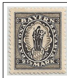
250 Madonna and Jesus