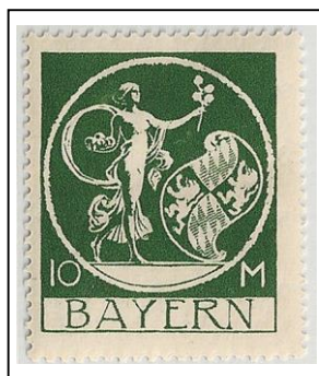
253 von Kaulbach's "Genius"