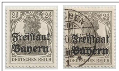
176 mint / postmarked