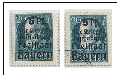
B3 mint / postmarked