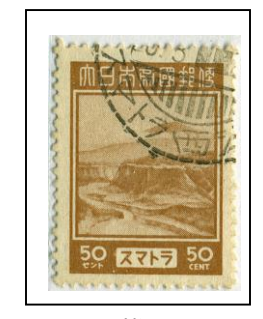
N25 Carabao Canyon