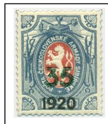
12a (type 2)