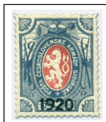
5 type 1

backstamped with collectors mark of Antonin Cerny, a prominent stamp dealer in Prague (1879-1938)