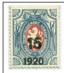
10a (type 2)