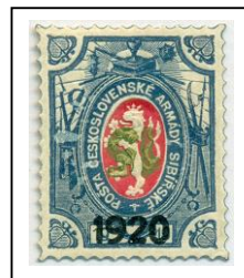
10 inverted overprint type 1