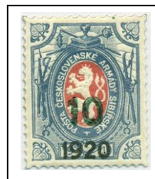
9a (type 2)

Note: all stamps in this series are backstamped with collectors mark of Antonin Cerny, a prominent stamp dealer in Prague (1879-1938)