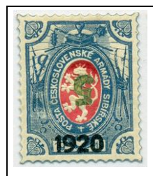
8 inverted overprint type 1