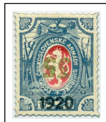
12 inverted overprint type 1