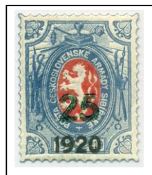
11a (type 2)