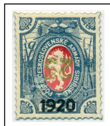
11 inverted overprint type 1