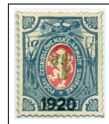
14 inverted overprint type 1