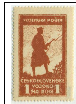
remainder Legion Sentinel