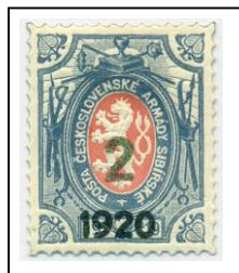
6a (type 2)