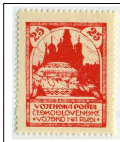
remainder Urn and Cathedral in Irkutsk