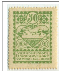
remainder Armored railroad Car