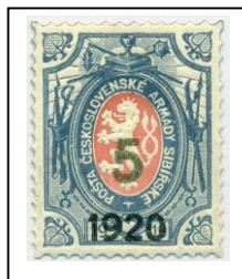
8a (type 2)