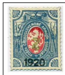
6 inverted overprint type 1