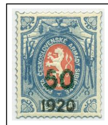
13a (type 2)