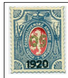
13 inverted overprint type 1