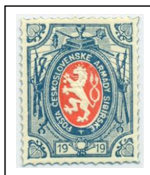
4a type 2