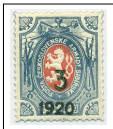
7a (type 2)