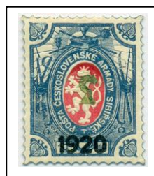
7 inverted overprint type 1