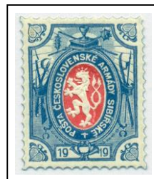
4 philatelic printing type 1