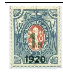
14 (type 1)