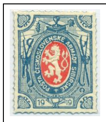
4 type 1

backstamped with collectors mark of Karl Kaplanek a noted dealer in Prague