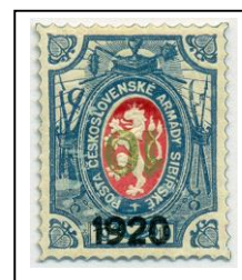
9 inverted overprint type 1

Note: all stamps in this series are backstamped with Lešetický-Ustředna, a prominent Expert committee in Prague + an unknown stamp