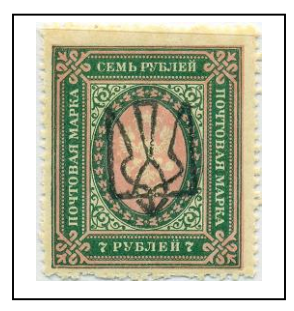
25m Odessa V