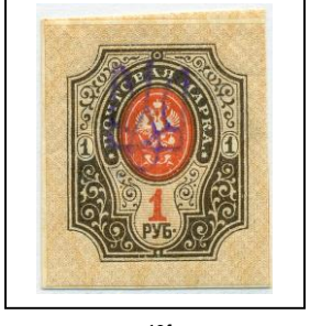
40f Kiev II