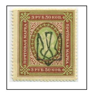
23m Odessa V