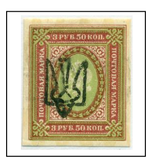
41m Odessa V