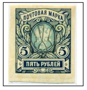
42m Odessa V