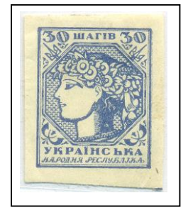
3 (ultra) Allegorical Ukraine