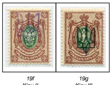
Kiev II Kiev III

unwatermarked, lozenges of varnish on stamp face, perf 14, 141/2 x 15