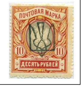
26m Odessa V