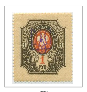
22f Kiev II