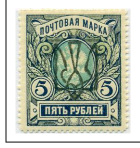
24m Odessa V