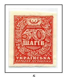
Post Horns with Value

In April, 1918, the above stamp designs were printed on thin cardboard and used as money tokens. They are not postage stamps despite being perforated.